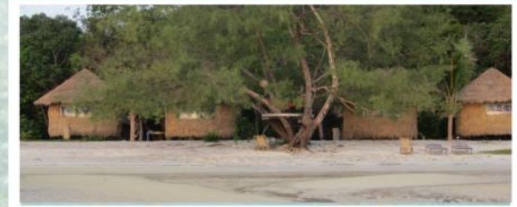
Normal Bungalows , (Beachfront, Kingsizebed, Fan, Safebox, Shared toilet ) Room Rate: $15.00/Night