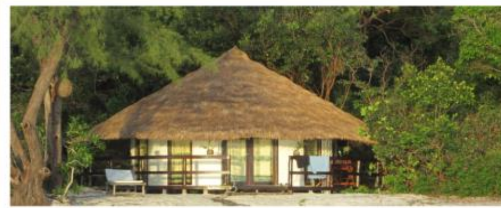
VIP Bungalows , (Beachfront, Mini bar, Terrace, Fan, Safe, Hammock, Private Sunbed, round Kingsizebed) Room Rate: $65.00/Night

Located 22 km about 2 hours boat ride from the Serendipity pier in Sihanoukville on beautiful white sandy beach of Saracen bay with 4 kms of unspoiled beach and crystal clear water.