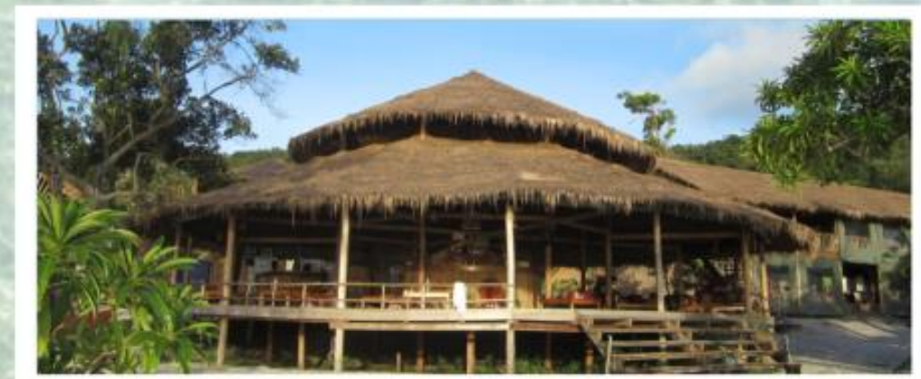
Dorm rooms are available from 5.00$ Per Person