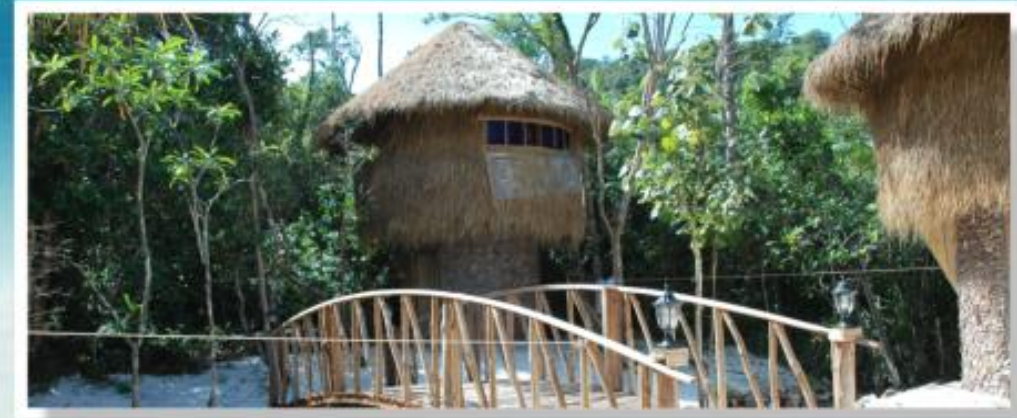
Private Bungalows , (Seaview, Kingsize bed, Fan, Safebox, Private toilet ) Room Rate: $25.00/Night