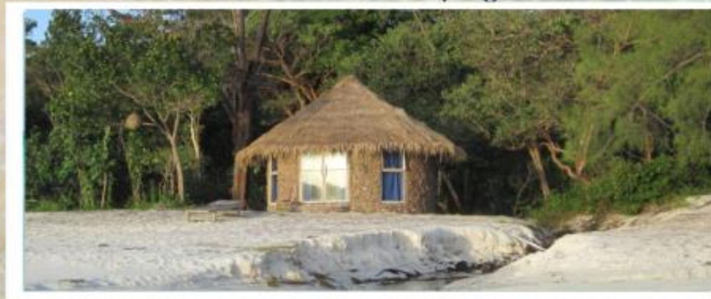
Deluxe Bungalows , (Beachfront, private Sunbed, Fan, Safebox, round Kingsizebed) Room Rate: $35.00/Night